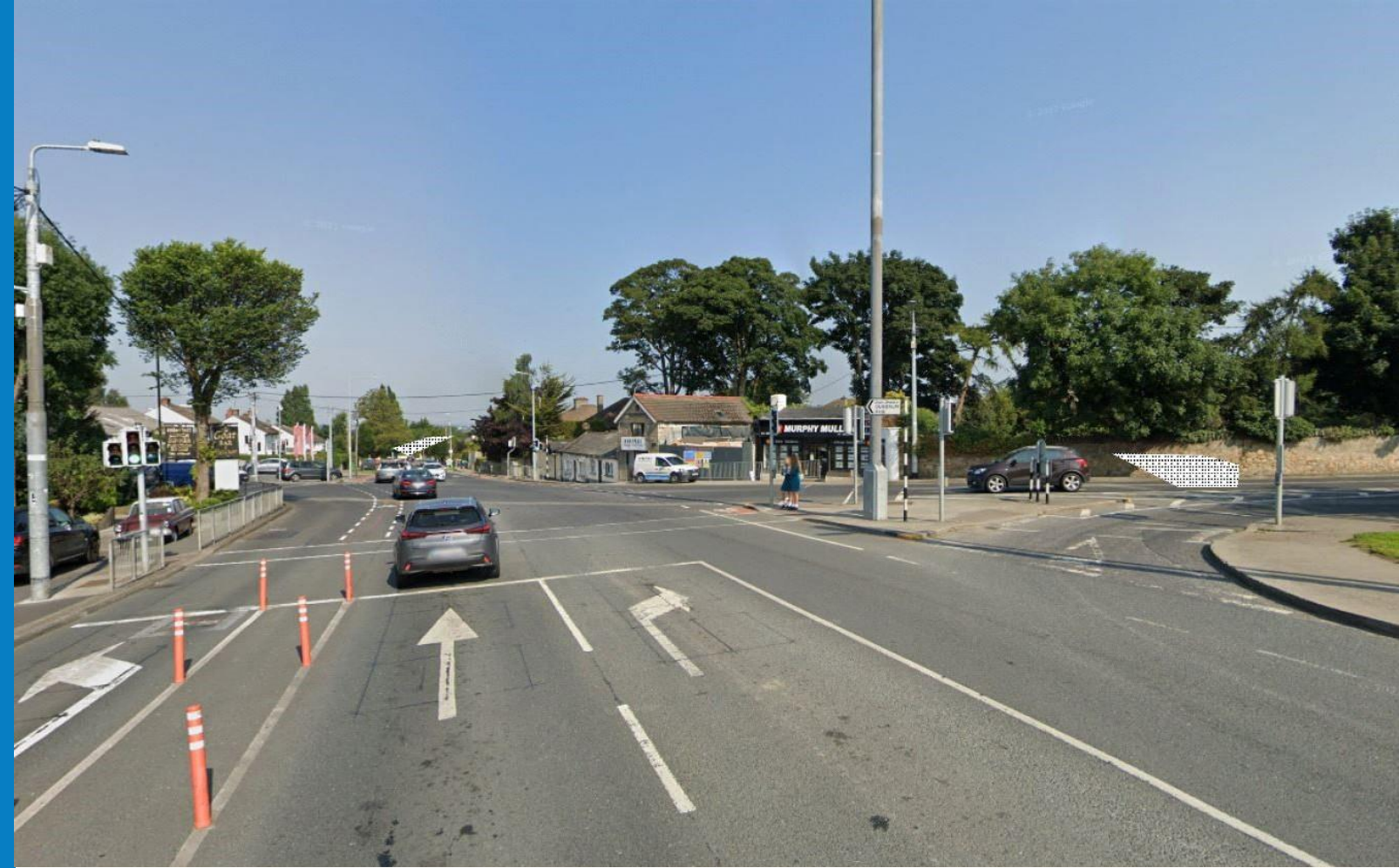
Visualisation of the proposed changes to the Goatstown Junction